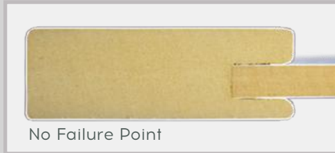
Cinch DuraLuxe Door

Thermofoil doors are fiberboard with a vinyl film glued on one side. If this glue loosens over time, the vinyl delaminates or peels off the front of the door. Age and heat exposure are common causes of delamination.