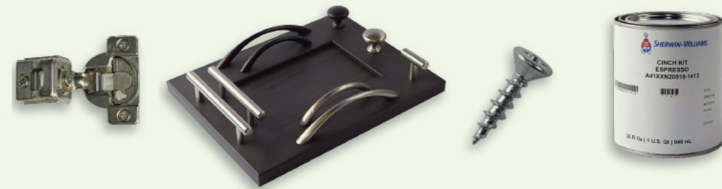
FLOUR NIMBUS OAK SABLE OAK ESPRESSO WALNUT MIST STORM GRAPHITE