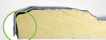
Frequent Failure Point